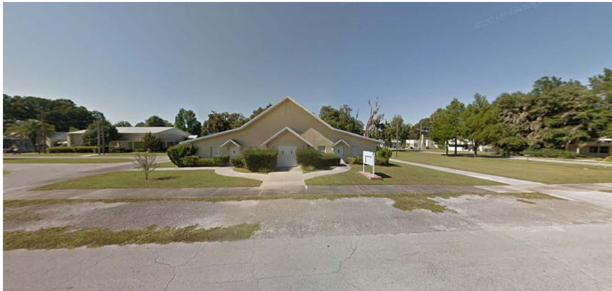
Google Street View 2013