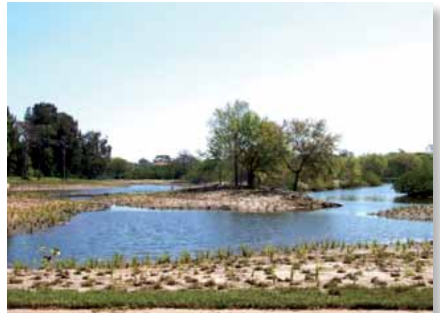
The Lancaster Tract habitat restoration project created low-salinity habitat that acts as a nursery ground for juvenile fish. The project also improves water quality entering Allens Creek from the surrounding urban area.