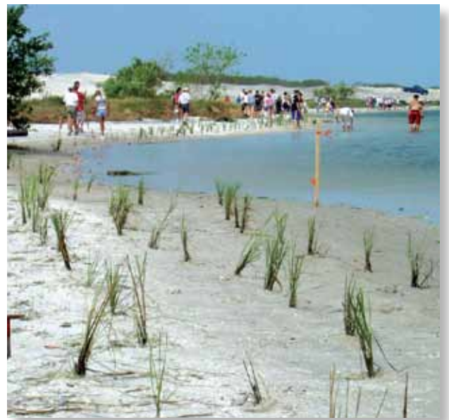
Above: At Schultz Preserve, volunteers plant marsh grass to provide habitat for juvenile fish and prevent erosion.