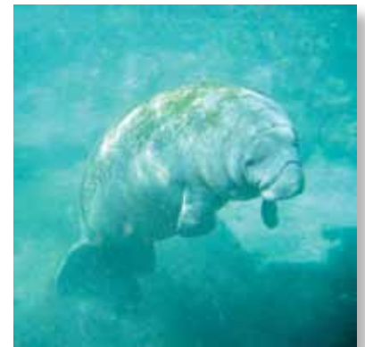
Over the past 25 years, the SWIM Program has funded numerous restoration projects and diagnostic studies to improve habitat for bay life.

On the cover: The series of photos shows the before, during and after phases of the Cockroach Bay restoration project. District staff designed and constructed this braided tidal creek to create habitat for Tampa Bay's fish and wading bird species.