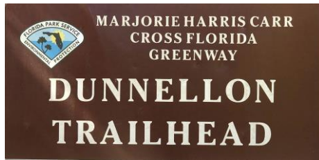
Dunnellon Trailhead Sign

The Dunnellon Trail is located in Marion and Citrus Counties and is part of the planned Heart of Florida 200-mile Bicycle Loop Trail. This 2.5 mile 12-foot wide multi-use paved trail offers wonderful views of the Rainbow River as it traverses through Blue Run of Dunnellon Park. The trail then connects to the Citrus County section with a bridge providing upstream and downstream views of the Withlacoochee River.