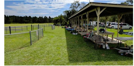
Rainbow Radio Control Air Park