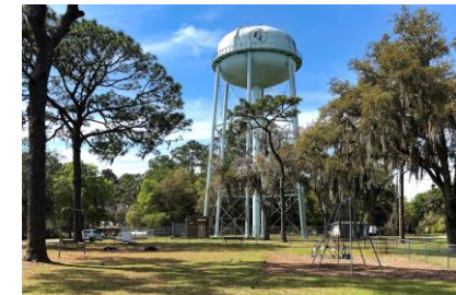
L.O. Robinson Park