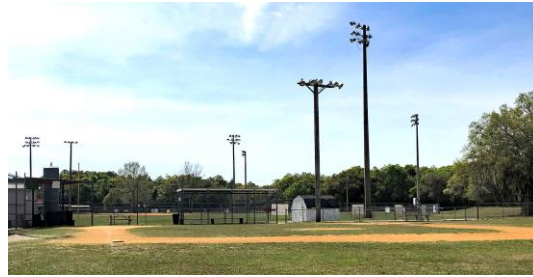
Dunnellon Little League Field

Dunnellon Little League Field, and the Tri-County Radio Controlled Airplane Club are available to the public. These are located on Bridges Road on the east side of the City Dunnellon.