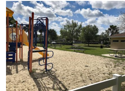
Ernie Mills Park

Ernie Mills Park, L.O. Robinson Park and Datesman Park Playground equipment, swings and picnic tables are part of Ernie Mills Park. A swing set can be found at L.O. Robinson Park while overflow and event parking is available at Datesman Park.