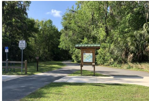
Trailhead at Blue Run of Dunnellon Park next to CR 484. This is a hub to reach the Dunnellon Trail as well as access the kayak ramp for the Rainbow River.

Development plans are progressing to connect this trail to the Withlacoochee State Trail in Citrus County and the Cross Florida Greenway Trail in Marion County. The Heart of Florida planned Loop Trail is managed by the FDEP Office of Greenways and Trails.