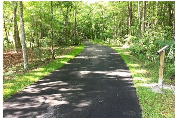
Blue Run Trail looking south with pond on left

Blue Run Trail follows the Rainbow River, one of the clearest aquatic systems on earth. The Rainbow River is an Aquatic Preserve, a Outstanding Florida Water and a National Natural Landmark. The Rainbow River provides habitat for many species of wildlife including forty species of fish and ten turtle species. Look and listen for the numerous wading birds found along the river and wood ducks in the pond. Otters and raccoons are frequently seen along the shoreline feeding on bivalves or crayfish. The floodplain forest along the river contains an array of wetland plants including the stately bald cypress, bays, red maple, sweet gum, Florida elm and lush emergent vegetation.