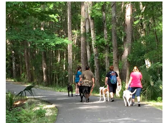
Exercise and good conversation