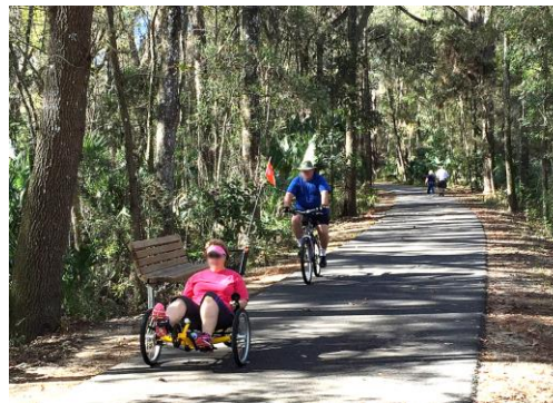
Cycling and walking the trail.