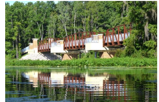
Trail bridge over Withlacoochee River