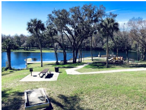
Chaplin Dinkins Park

Chaplin A. Dinkins Park , (12099 Palmetto Court) A swimming area on the Rainbow River, a small playground and an area for fishing are located in the park. Benches, picnic tables and restroom facilities are available. There is an entrance fee.