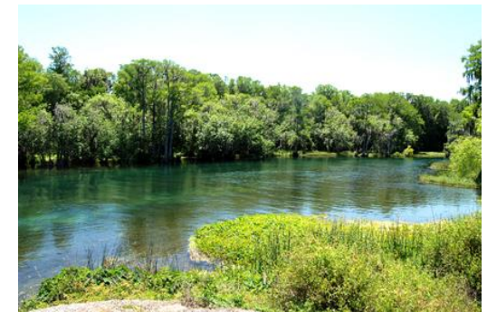
Blue Run Park frontage on Rainbow River