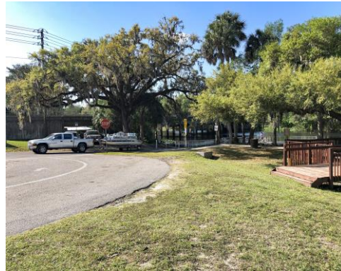
Boat Ramp at Centennial Park

Centennial Park and Boat Ramp (12196 South Williams Street) is located on the Withlacoochee River behind Dunnellon City Hall. This park includes a boat ramp and floating dock as well as picnic tables and restroom facilities. There is also a large deck with bench seating.