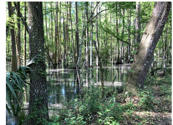
Cypress forest and wetlands next to trail