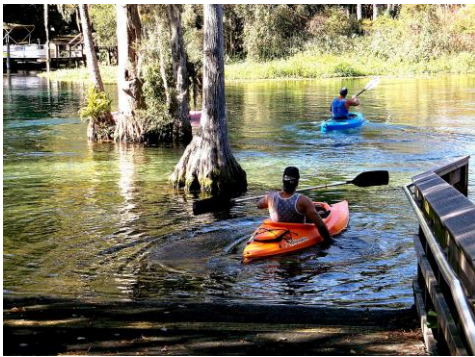
Kayaks enter river at access ramp in park

Three trails include six Florida natural communities in the park including floodplain forest, hydric hammock, upland mixed forest, xeric hammock, sandhill, and spring run stream. There are two trailhead-parking areas, one at CR 484 and the second at San Jose Blvd. Connection