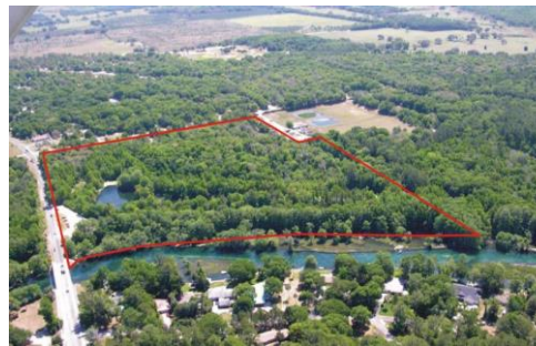
Blue Run of Dunnellon Park

Blue Run of Dunnellon Park (19680 East Pennsylvania Ave.) is the city's largest park at 32 acres. It has paved and unpaved trails, a river access ramp for paddlers and tuber take out and an interior spring-fed pond with fishing access points. Benches provide rest stops for the walkers, runners and cyclists. The tree lined paved Blue Run Trail connects to the Dunnellon Trail on the Cross Florida Greenway and leads one to a delightful bridge over the Withlacoochee River.